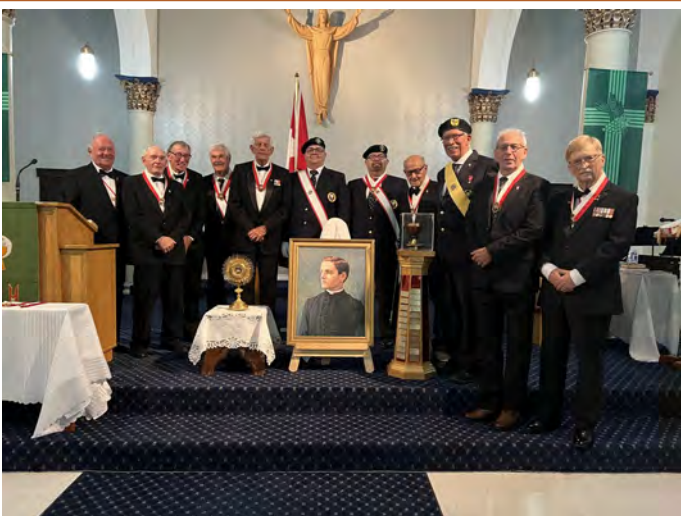
The Dalton Assembly 1645 conducted an installation of officers in the presence of Relics of Blessed Michael McGivney at St. Joseph Church, Riverhead, Harbour Grace, Newfoundland.